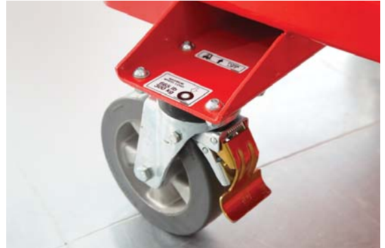
Heavy duty, non-marking castors