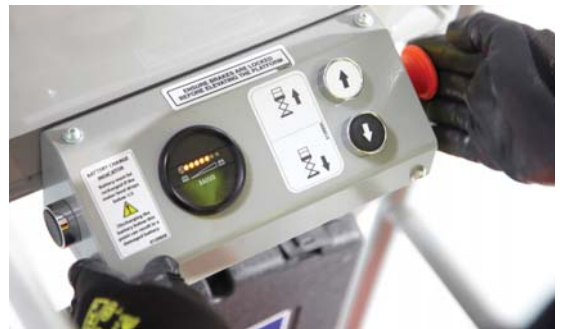
Simple, easy to operate push button controls