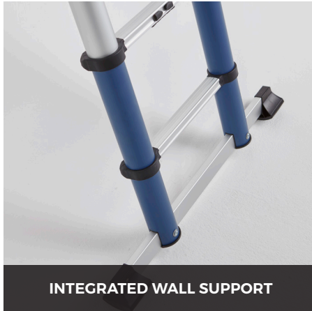
INTEGRATED WALL SUPPORT