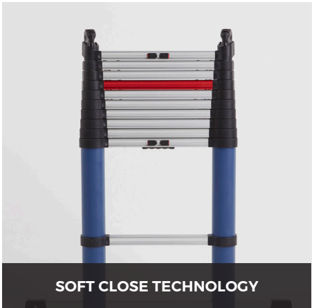
SOFT CLOSE TECHNOLOGY