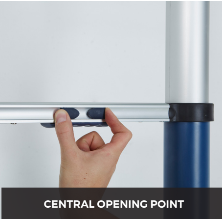
CENTRAL OPENING POINT